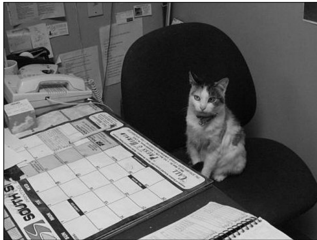
Our "receptionist" Jersey is available for adoption!

To make changes, email us at newsletter@hillsidespca.com or drop us a note. Thank you!