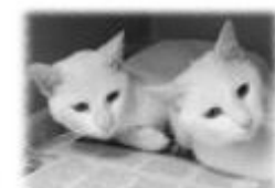
Colada & Bacardi