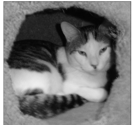
Mikey (available for adoption)

After almost a year since being rescued, Mikey is still waiting for his forever home.