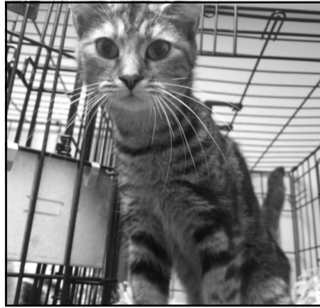
Oodles of cats and kittens