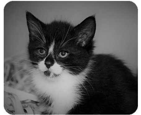
One of MANY Kittens!