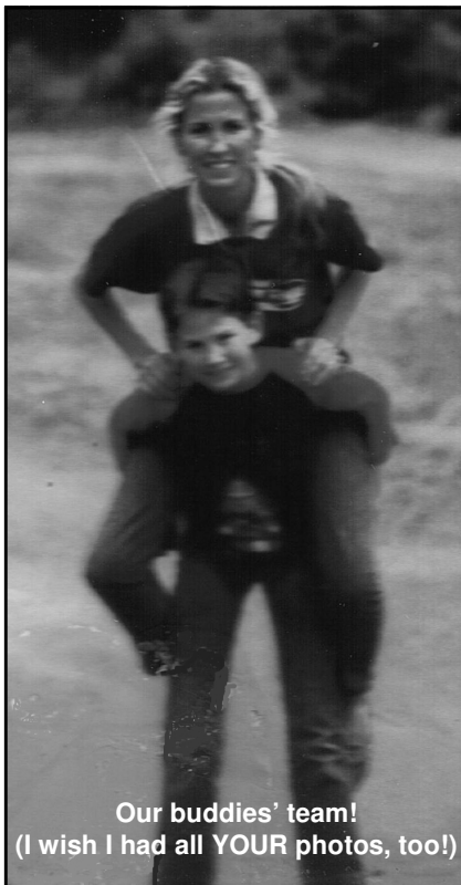
Our buddies' team! (I wish I had all YOUR photos, too!)