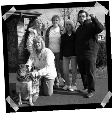
Shenandoah Manor Fall Festival