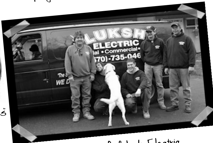
The Crew of Luksh Electric

Hope to see you at one (or all) of our up-coming events and happenings!