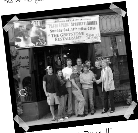
"Pasta 4 Paws II" Greystone Restaurant