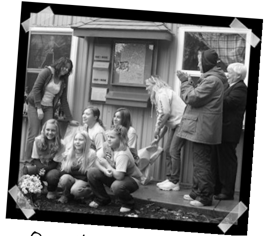
Open House-Girl Scouts Troop 1065 Llewellyn