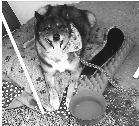
Teak — July 2013

"Please help me help my buddies at the Hillside SPCA."