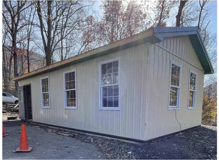
Pictured above: Progress on the NEW Meet & Greet Room.

Special Thank You to the ANIMAL LOVERS who report cases of suspected animal cruelty, to the Hillside Cruelty Officers who respond to and provide support for those animals, to the Law Enforcement officials who investigate and to the District Attorney's Office for prosecuting the guilty.