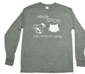
Long Sleeve $28.00

Shop online now on our website: https://www.hillsidepca.com/store/