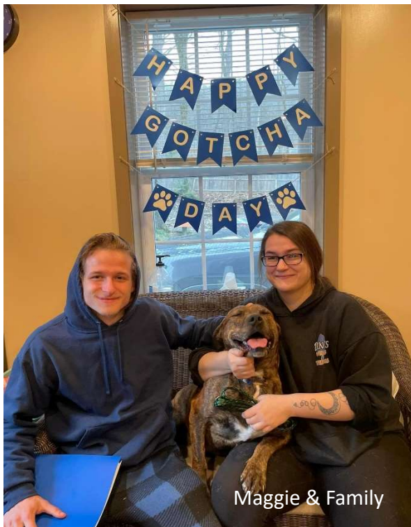
Maggie & Family