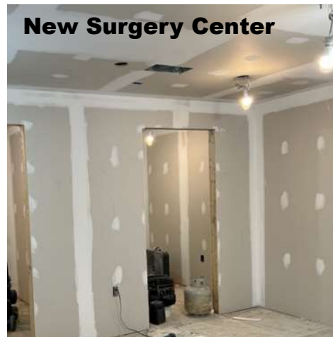
New Surgery Center

DONATE ONLINE @: https://www.hillsidespca.com/donate/