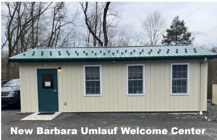
New Barbara Umlauf Welcome Center